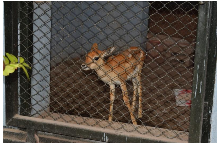
Barking deer - young