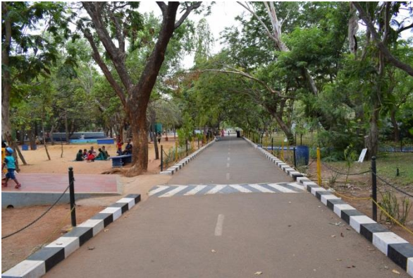
Attractive Leading Path