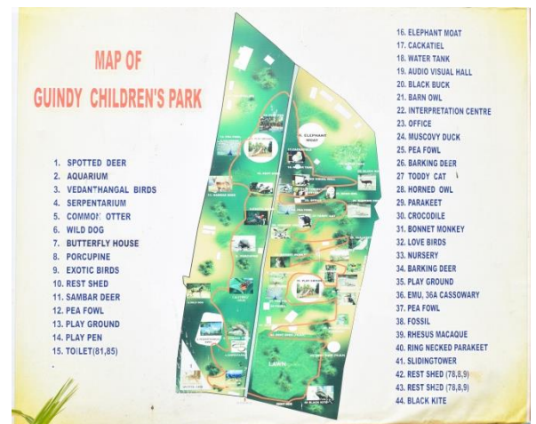
Park Route Map