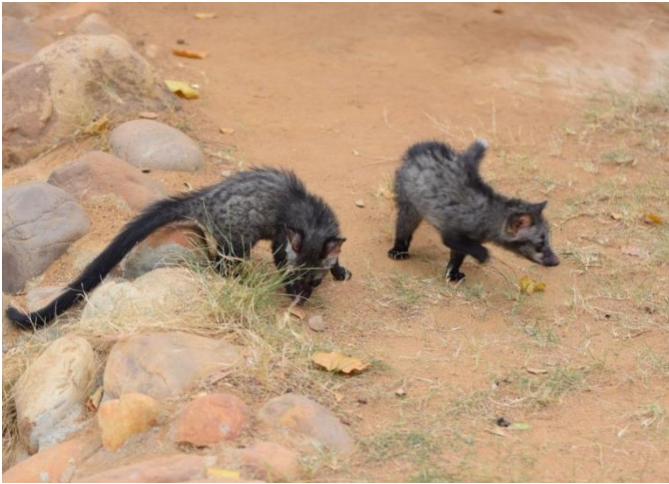
Palm Civet - youngones