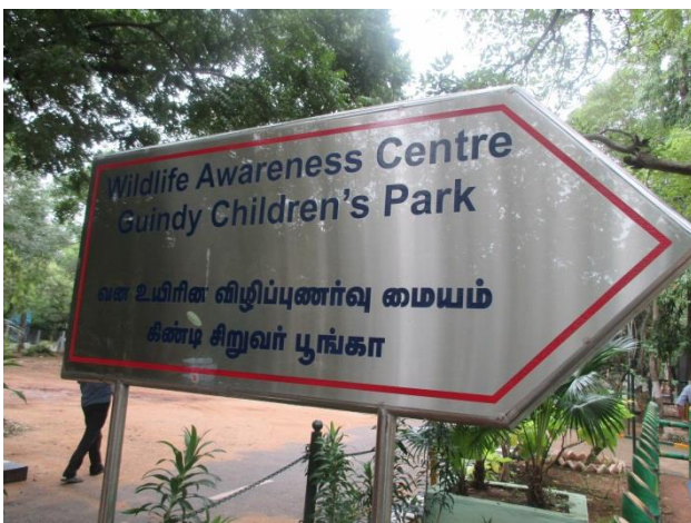
Modernised Display Board