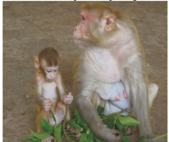
Rehesus monkey - with youngones